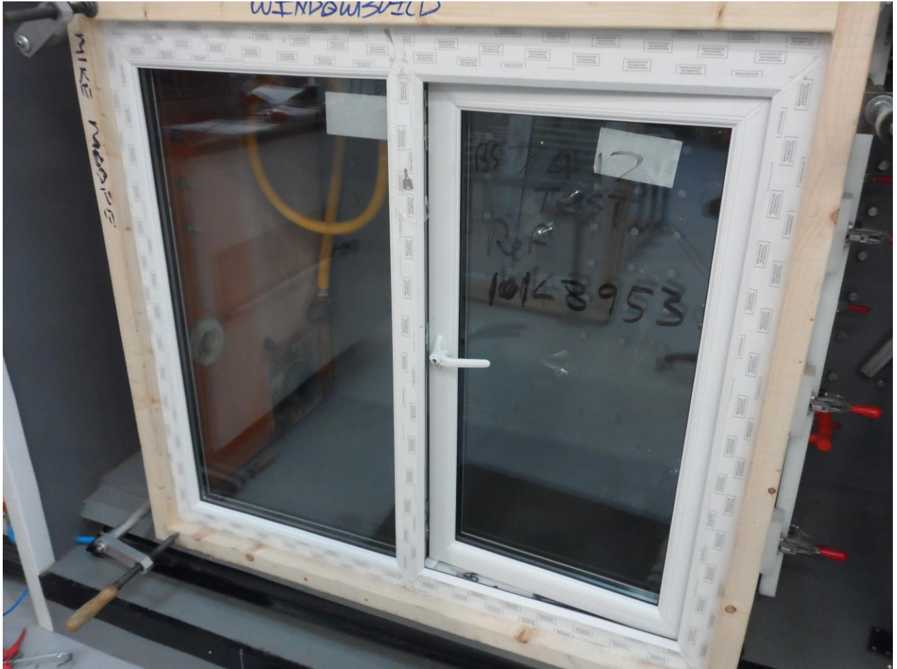
Photo of sample